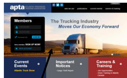
TOP BANNER (960 X 337 pixels)

*Company links are also added with placement ad. By clicking on the ad, members and browsers will automatically connect to your website.