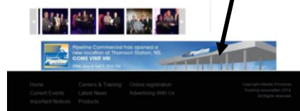
BOTTOM BANNER (728 X 90 pixels)