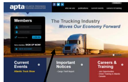
TOP BANNER (960 X 337 pixels)

*Company links are also added with placement ad. By clicking on the ad, members and browsers will automatically connect to your website.